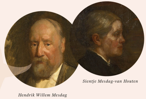
Hendrik Willem Mesdag